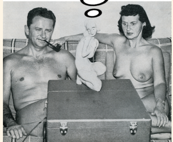
- Submitted by Jon