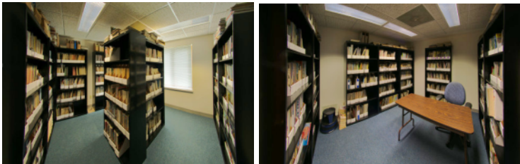
The 16,000 magazines. It may not look like much, until you count the shelves and consider how thin magazines can be.