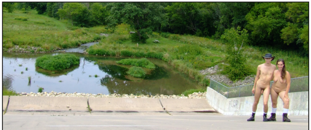
[The huge spillway at Duck Egg County Park, usually not naturist friendly.]